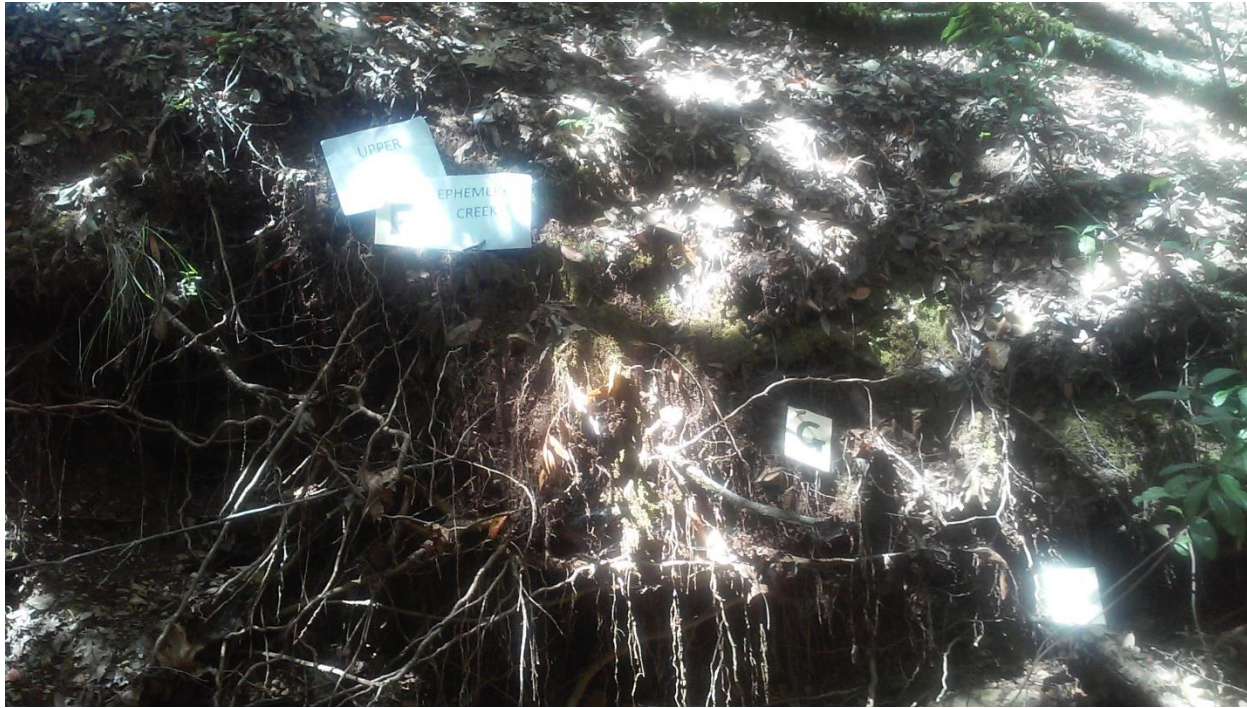
F, G and H